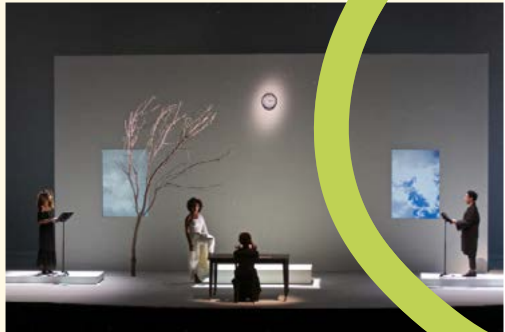
CARRIE MAE WEEMS'S GRACE NOTES: REFLECTIONS FOR NOW , 2016