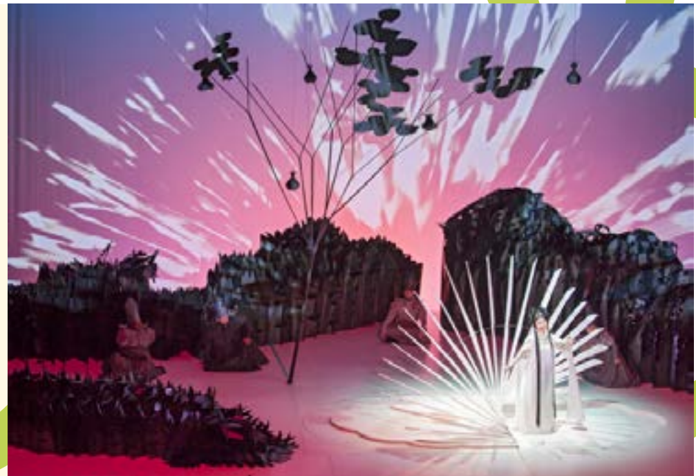
PARADISE INTERRUPTED, 2015

“It will not be like most festivals... but a unique and fertile ground for the young, and a dignified home for the masters.” — Gian Carlo Menotti