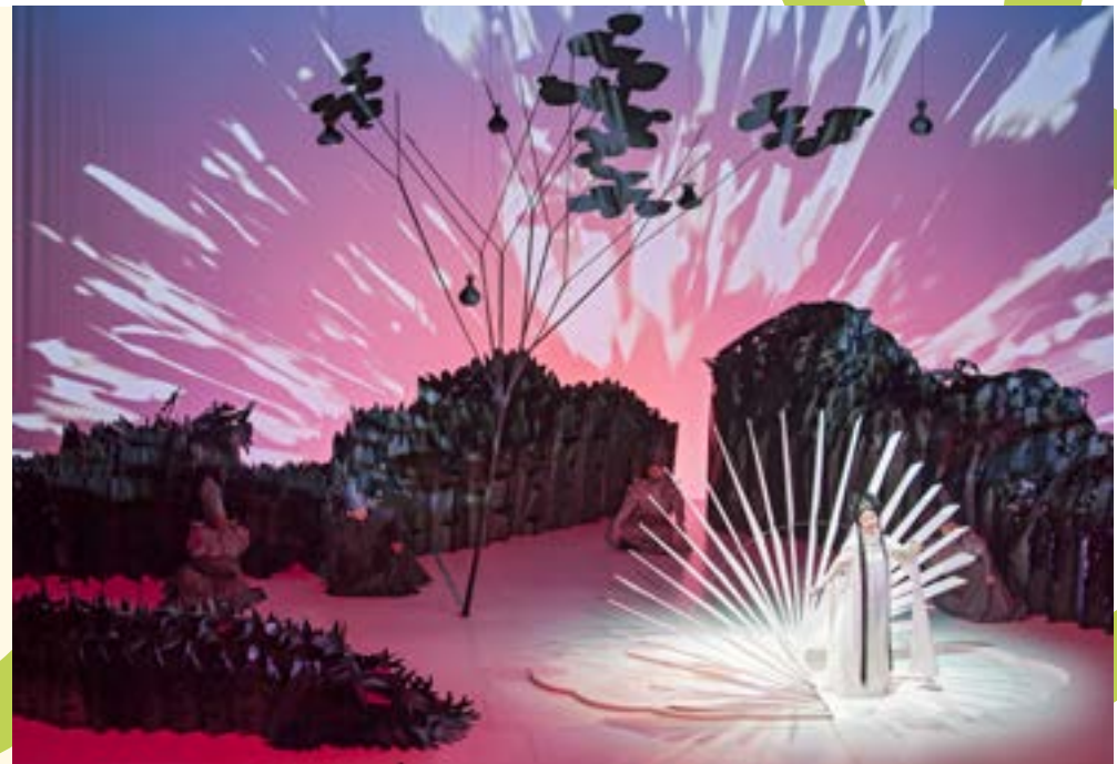
PARADISE INTERRUPTED, 2015

“It will not be like most festivals... but a unique and fertile ground for the young, and a dignified home for the masters.” — Gian Carlo Menotti