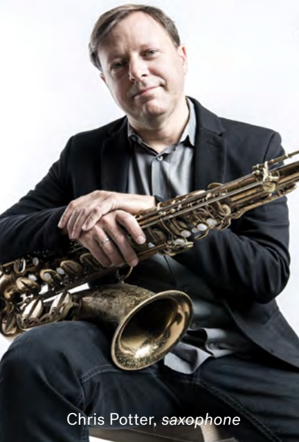
Chris Potter, saxophone