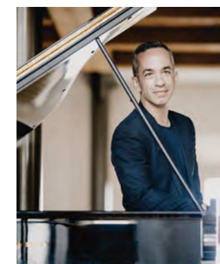
Inon Barnatan, piano

Approximately 1 hour, 30 minutes Tickets start at $38