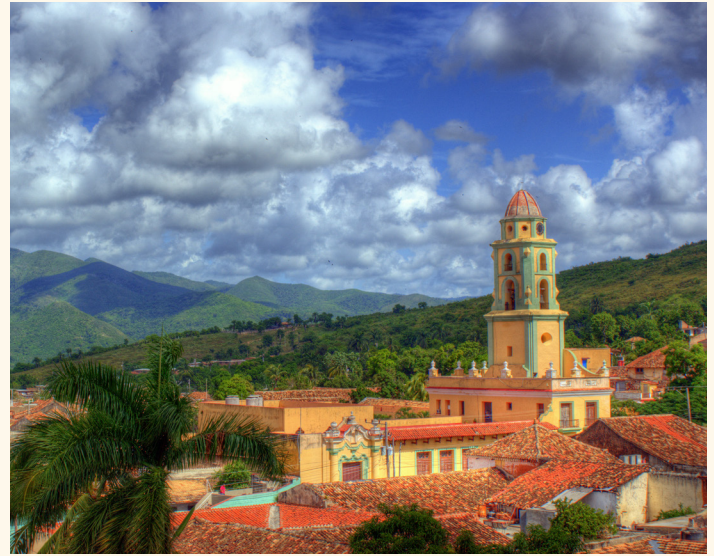
Finca La Vigía (left), the Tower of St. Francis of Assisi, Trinidad (right), and panorama of Old Havana (below)